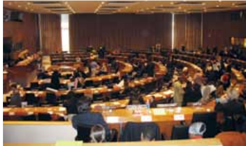
The United Nations