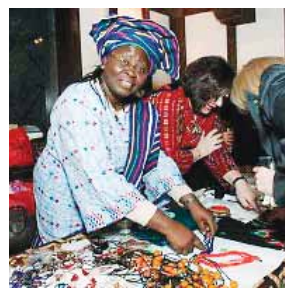
Craft Fair at UNCSW